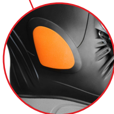
Reinforced ankle protection