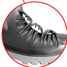
Flexible metatarsal protection

ORDER NOW: sales@primemoverworkwear.com.au Or Call us on: AU 1300 088 966 / NZ 0800 880 208